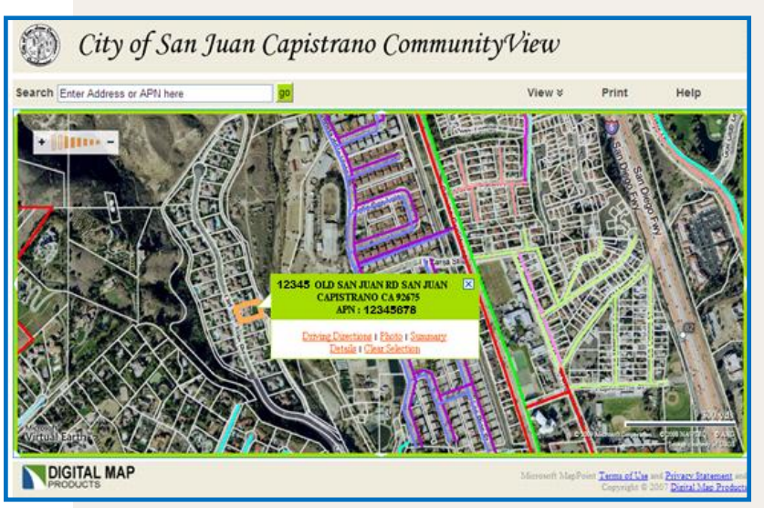
Publish select property and city information such as: property characteristics, zoning, street sweeping schedules & historic buildings

Empower city residents to self-service many city requests by publishing select property and city information to the web using CommunityView™. Residents can quickly search for properties, zoom and pan around the map, view property details and city specific layers, and print maps. CommunityView™ is a key component of e-government initiatives.